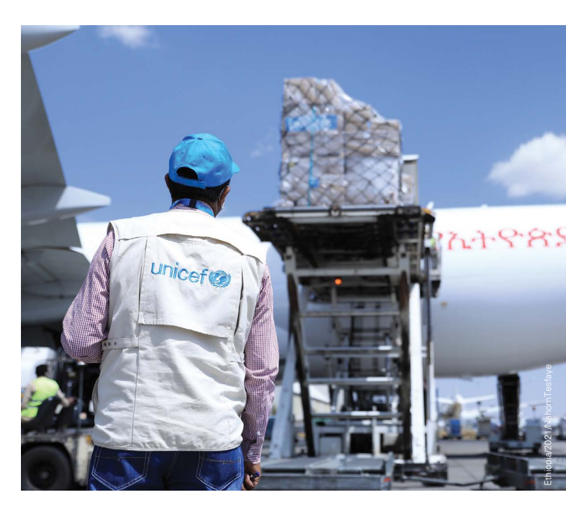
Photo: At the airport in Addis Ababa, Ethiopia, a UNICEF worker awaits the unloading of supplies to support the COVID-19 response in Africa. (January 2021)

In 2021, UNICEF Canada launched the #GiveAVax Matching Fund with Global Affairs Canada, raising $9.6 million from Canadians across the country, which was matched by the Government. The funds helped vaccinate nearly 4 million people in lowincome countries against COVID-19. The Government of Canada also supported numerous UNICEF Canada projects, including maternal, newborn and child health through our Saving Children's Lives (The 25th Team®) projects, our UNdaunted campaign in Somalia to increase girls' access to education, especially for those with disabilities, and our Back to School Better program supporting education for refugee and displaced girls in Burkina Faso, the Democratic Republic of the Congo and Mali during COVID-19. We thank the Government of Canada for their continued partnership and trust.