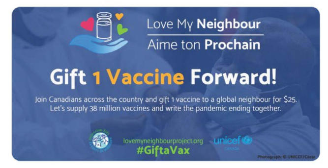
1:59 PM · Jul 22, 2021 · Twitter for iPhone

Ending the pandemic is a global effort. The #LoveMyNeighbourProject collects donations for @UNICEFCanada to deliver 2 doses of vaccine to the world's hardest-to-reach places. #Orléans, I encourage you to support this amazing initiative & #GiftaVax at bit.ly/3iAw9fS #LMN